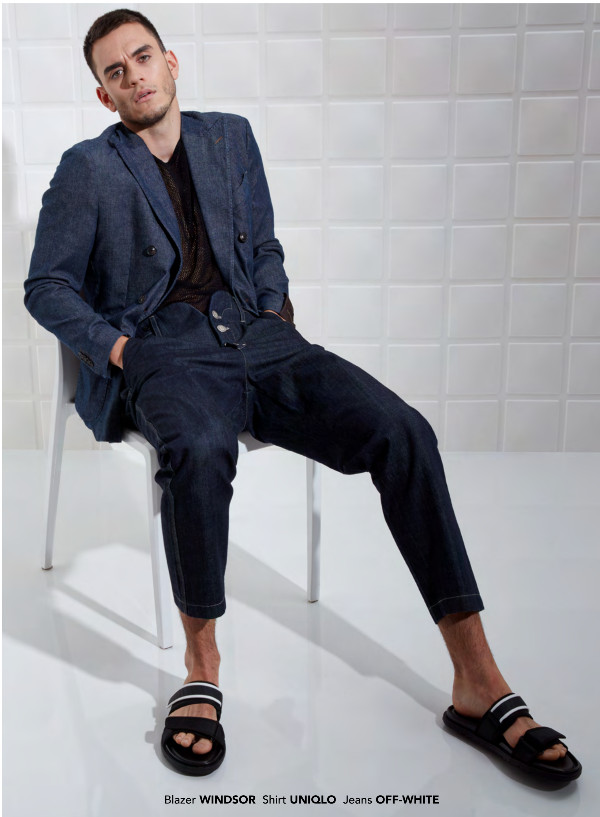
Blazer WINDSOR Shirt UNIQLO Jeans OFF-WHITE