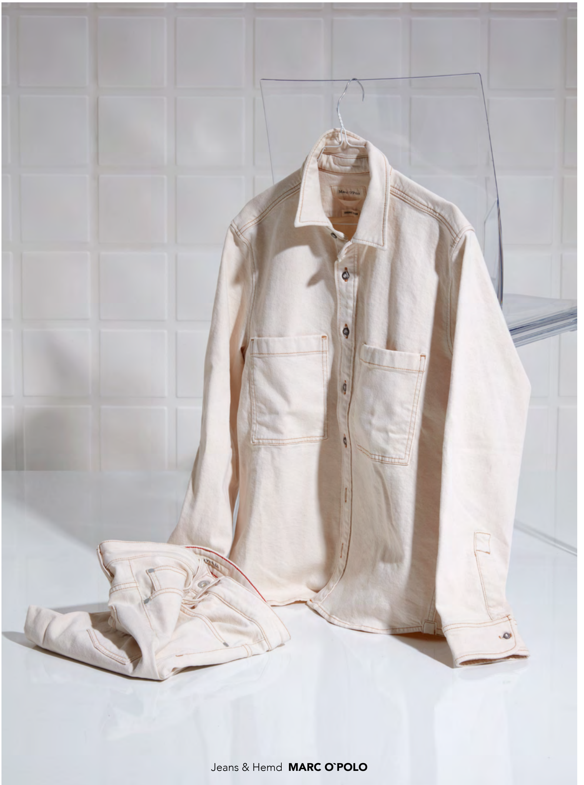
Jeans & Hemd MARC O'POLO