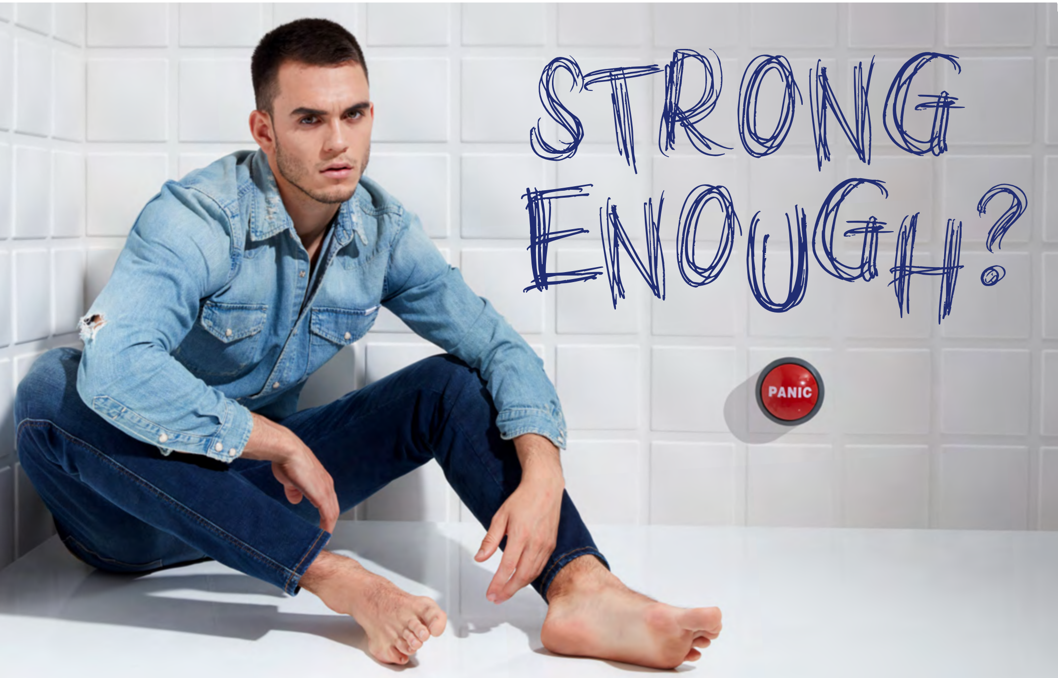
Hemd MOTHER Jeans PIERRE CARDIN