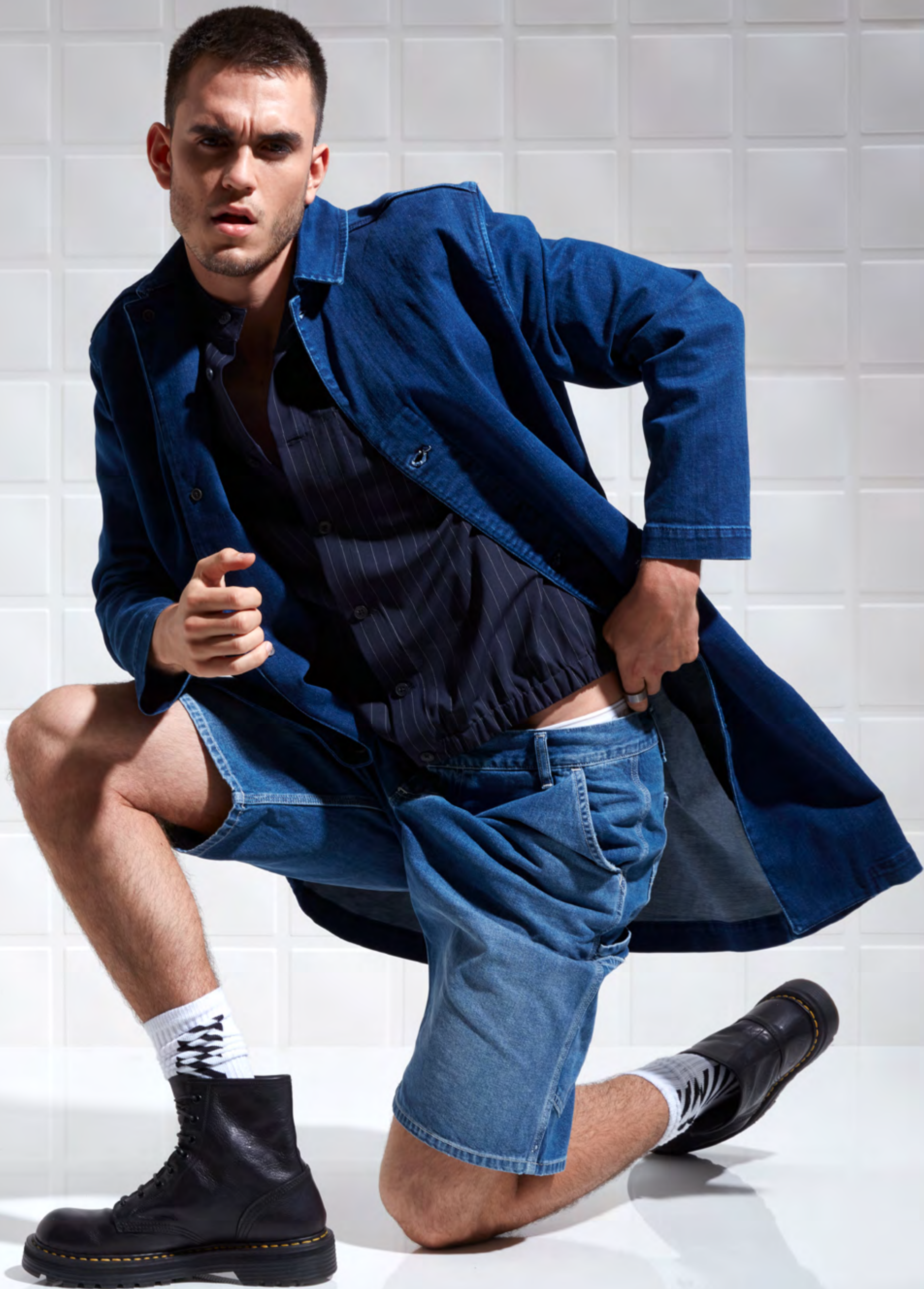
Mantel WEEKDAY Shirt PHILLIP LIM Shorts CARHARRT Schuhe PREMIATA