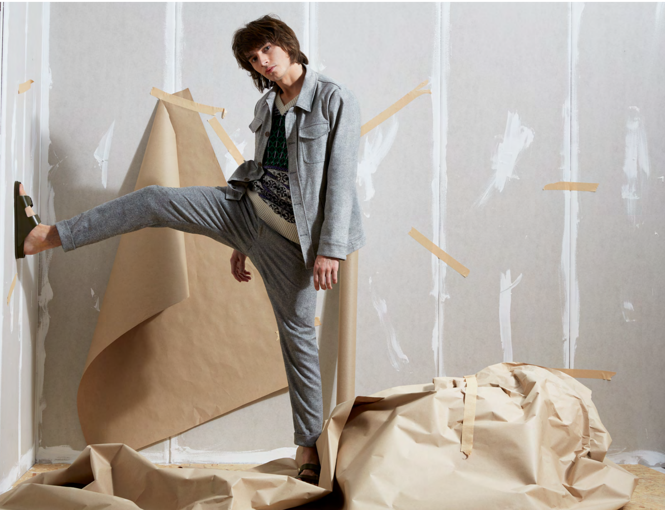
Overshirt CARL GROSS / Hose CARL GROSS / Schuhe BIRKENSTOCK