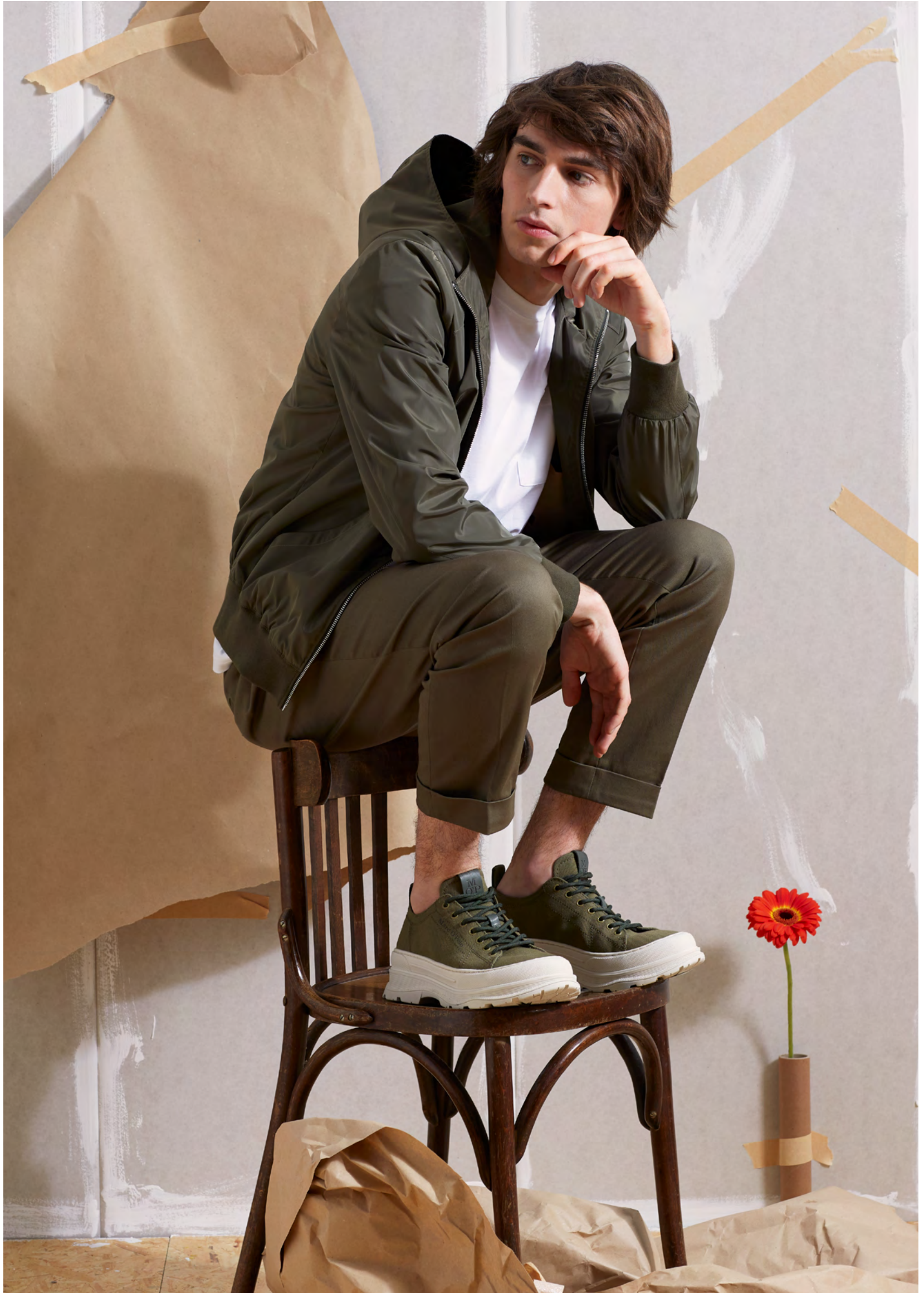
Jacke CG - CLUB OF GENTS T-Shirt SEIDENSTICKER STUDIO Hose SEIDENSTICKER STUDIO Schuhe MARC O'POLO