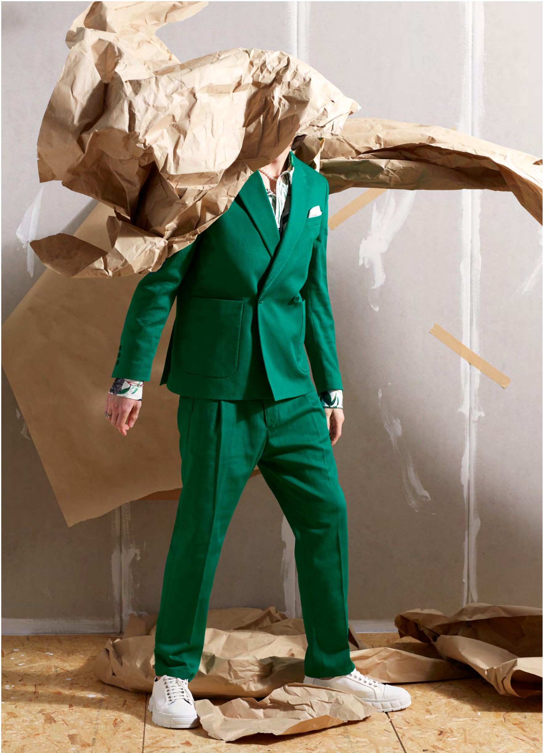
Anzug DRYKORN / Hemd DEDICATED / Schuhe VIRÓN