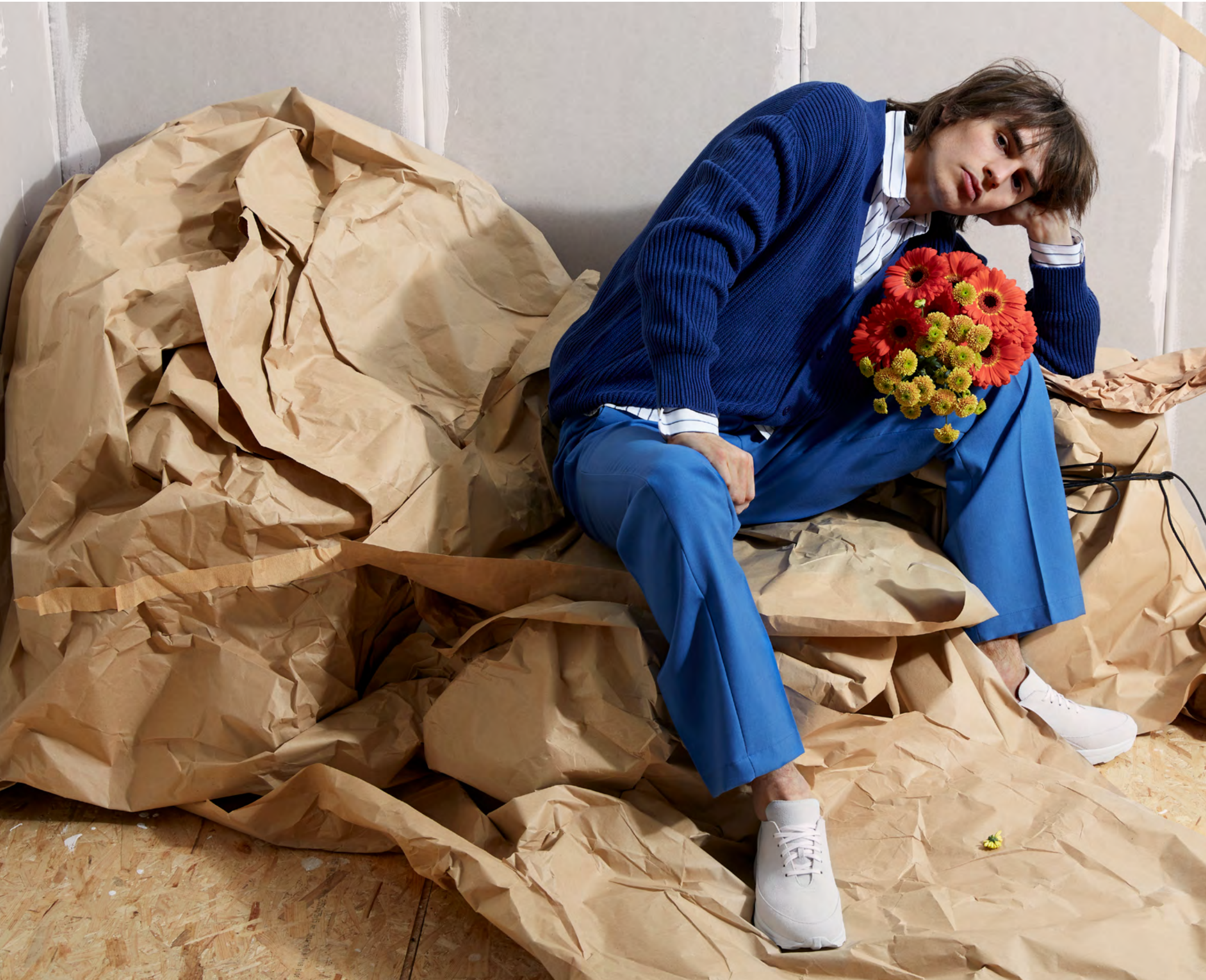
Strickjacke SEIDENSTICKER STUDIO / Hemd SEIDENSTICKER STUDIO / Hose CLOSED / Schuhe EKN