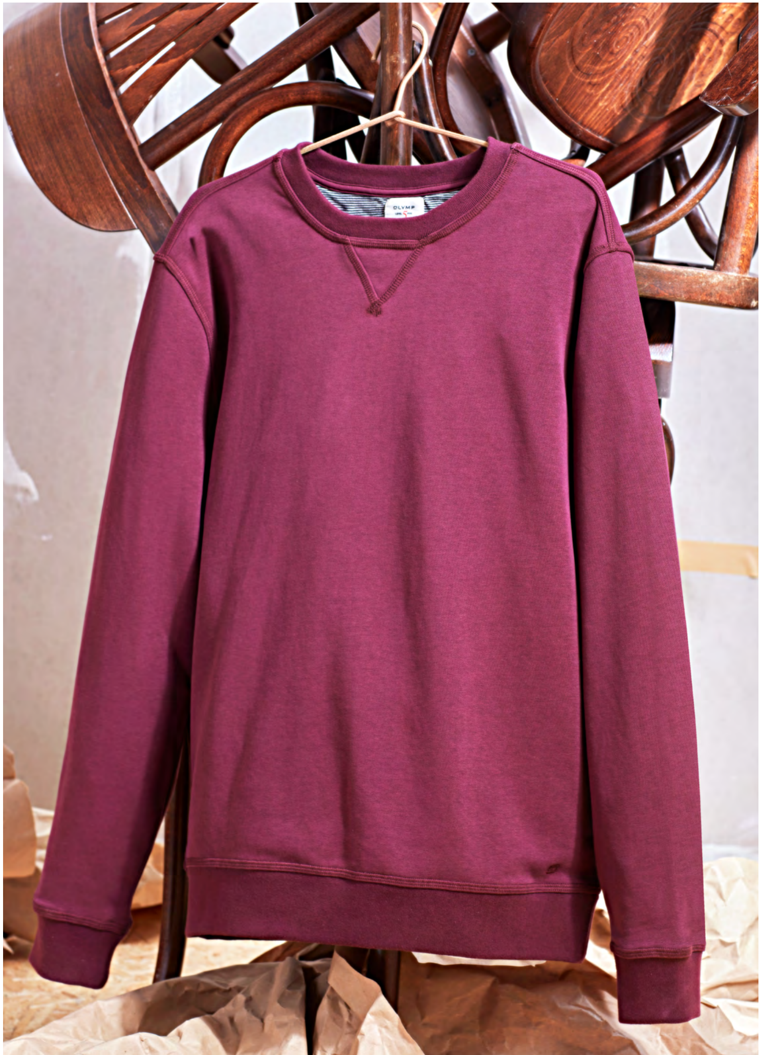
Sweater OLYMP LEVEL 5