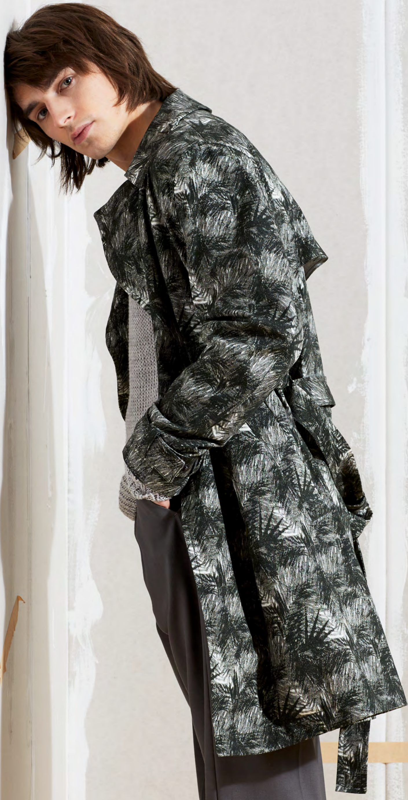
Mantel DRYKORN / Pullover IRIS VON ARNIM / Hose CLOSED